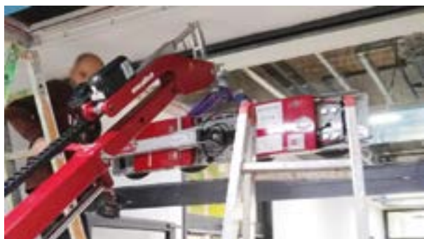
The lightweight, compact design ensures particularly flexible application options