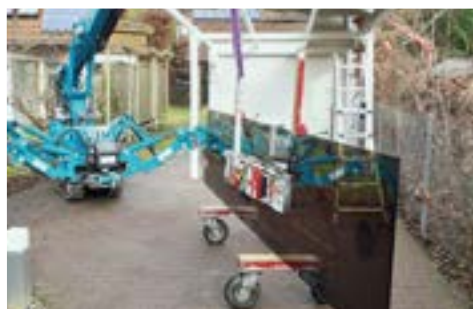
Use the UPT800 to transport the elements on the construction site