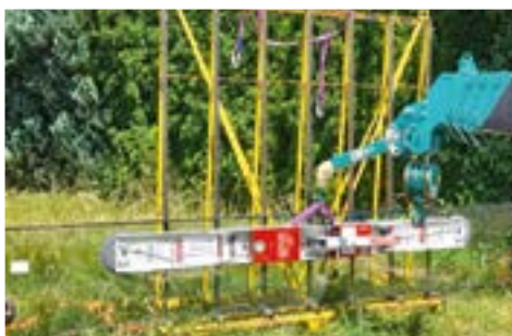
With a length of 2.16 m, the UPG450 is ideal for long, slim elements