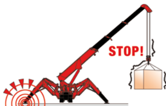
UNIC stability protection system