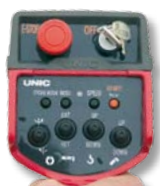
Standard radio remote control