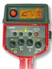
Optional radio remote control with digital feedback