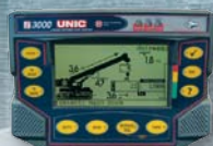
Safe load indicator