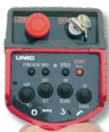
Radio remote control